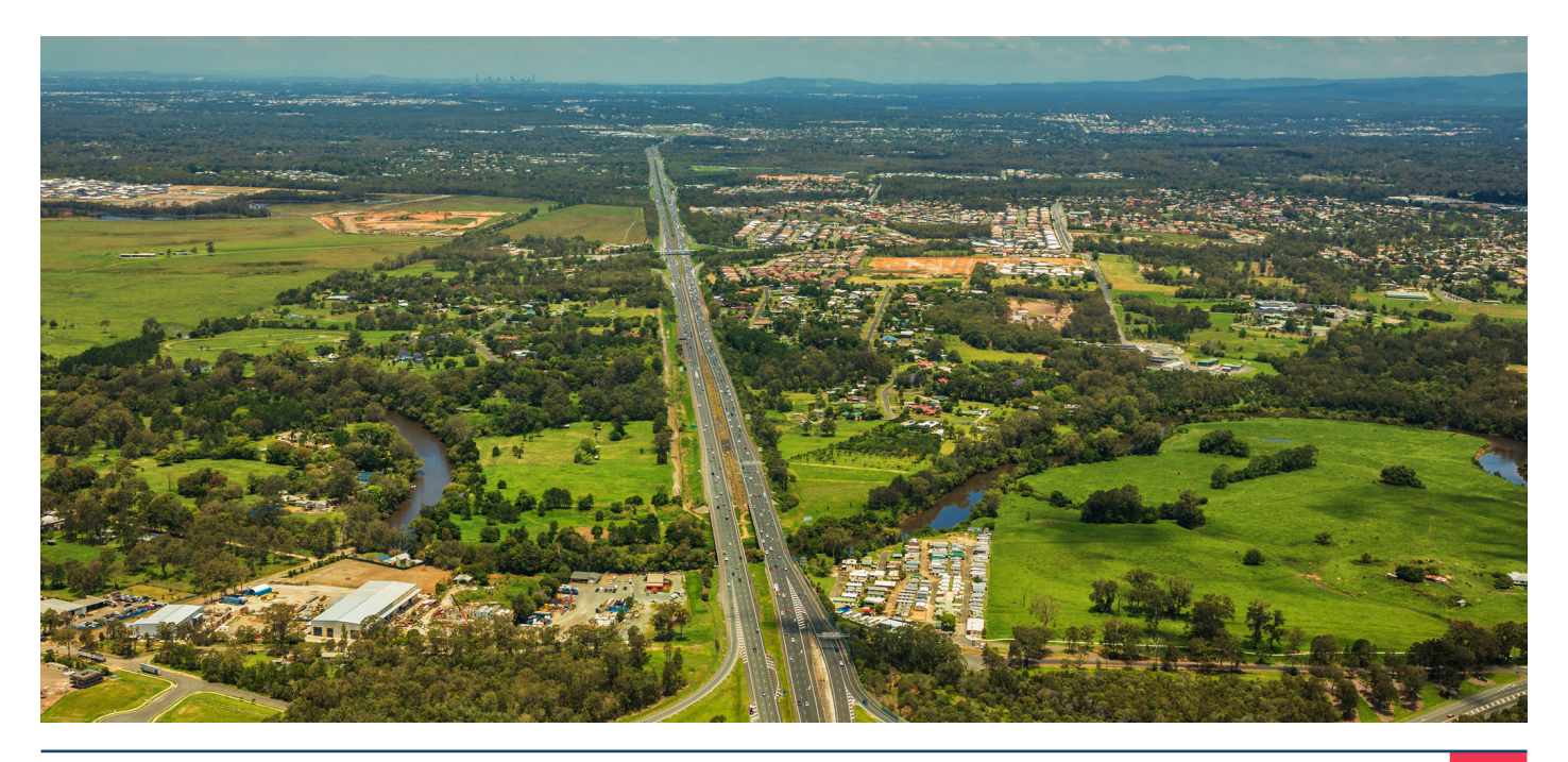
MORETON BAY REGION: Growth leader in South East Queensland

The increased demand has seen the value of new loans to investors rise for nine consecutive quarters to July 2021, doubling the number of investor loans in Queensland since March 2021, according to the ABS.